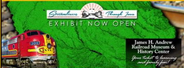
EXHIBIT NOW OPEN

Admission included with most train tickets (excluding trolley tickets)